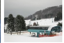
1200 ft Verti-

Leave Chippewa at 6:30 pm and New Castle at 7:00 pm Staying at the Inn on the Lake in Canandaigua, NY.